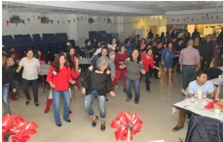
Thank you to the FAACV community for a great turnout.