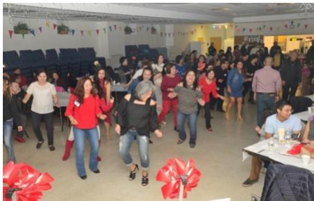
Thank you to the FAACV community for a great turnout.