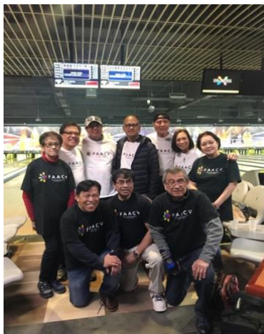
Team FAACV ready to strike